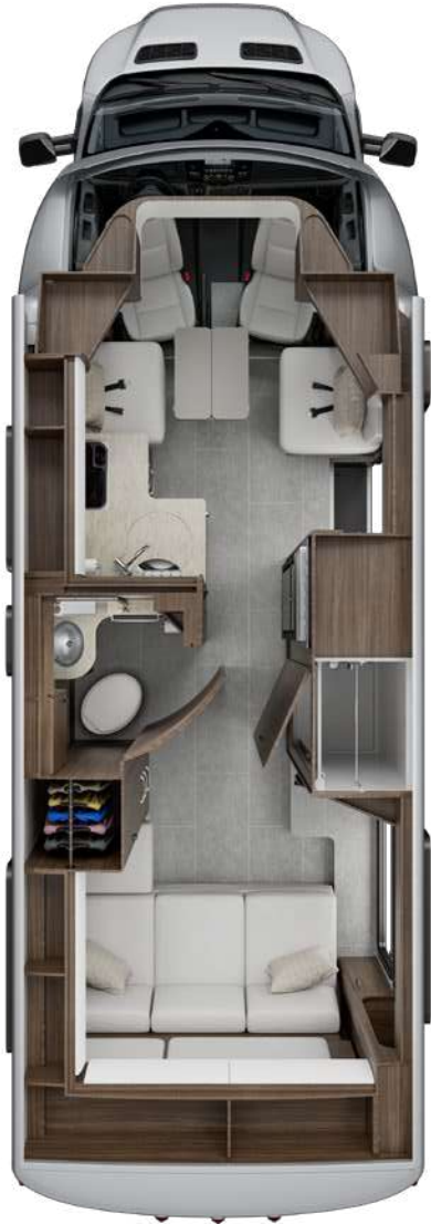
Rear Lounge | W24RL