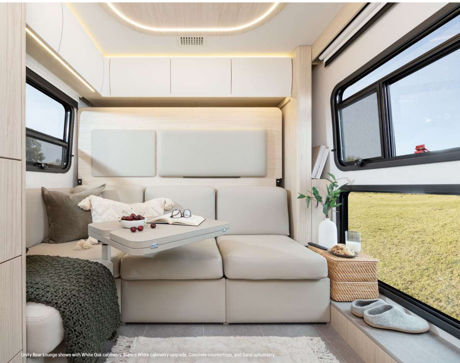
Unity Rear Lounge shown with White Oak cabinetry, Bianco White cabinetry upgrade, Concrete countertops, and Sand upholstery.