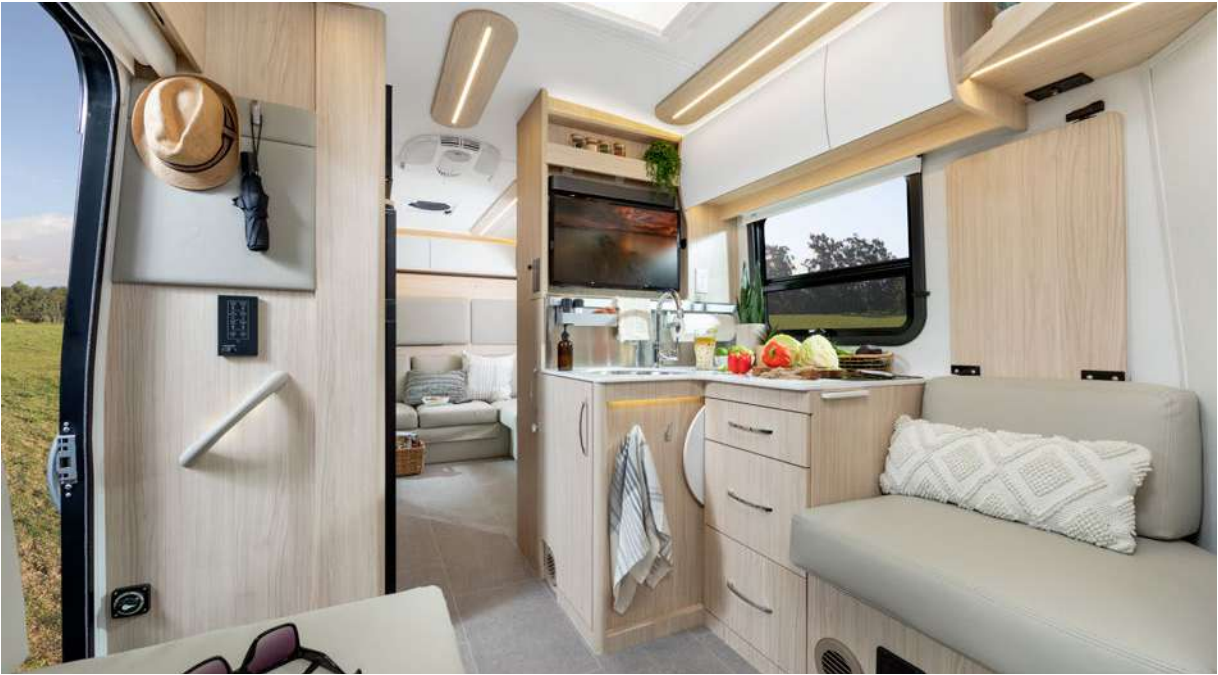
White Oak shown with Cabelnry Upgrade