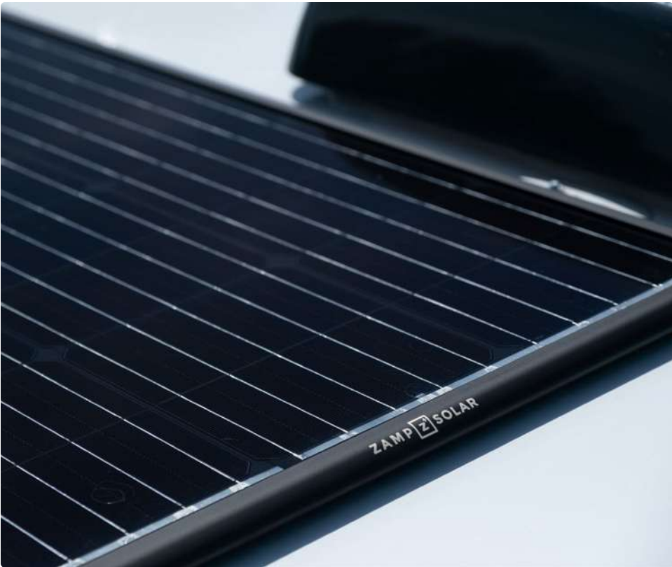
Rigid Solar Panels with Control Panel 200 W or 400 W