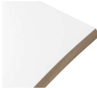
Bianco White FENIX NTM®