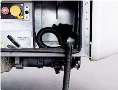
Macerator Sewage Discharge With Manual Disconnect