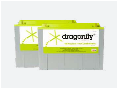
Dual 100 A-h, 12 V Lithium Coach Batteries With Built-in Heating Function