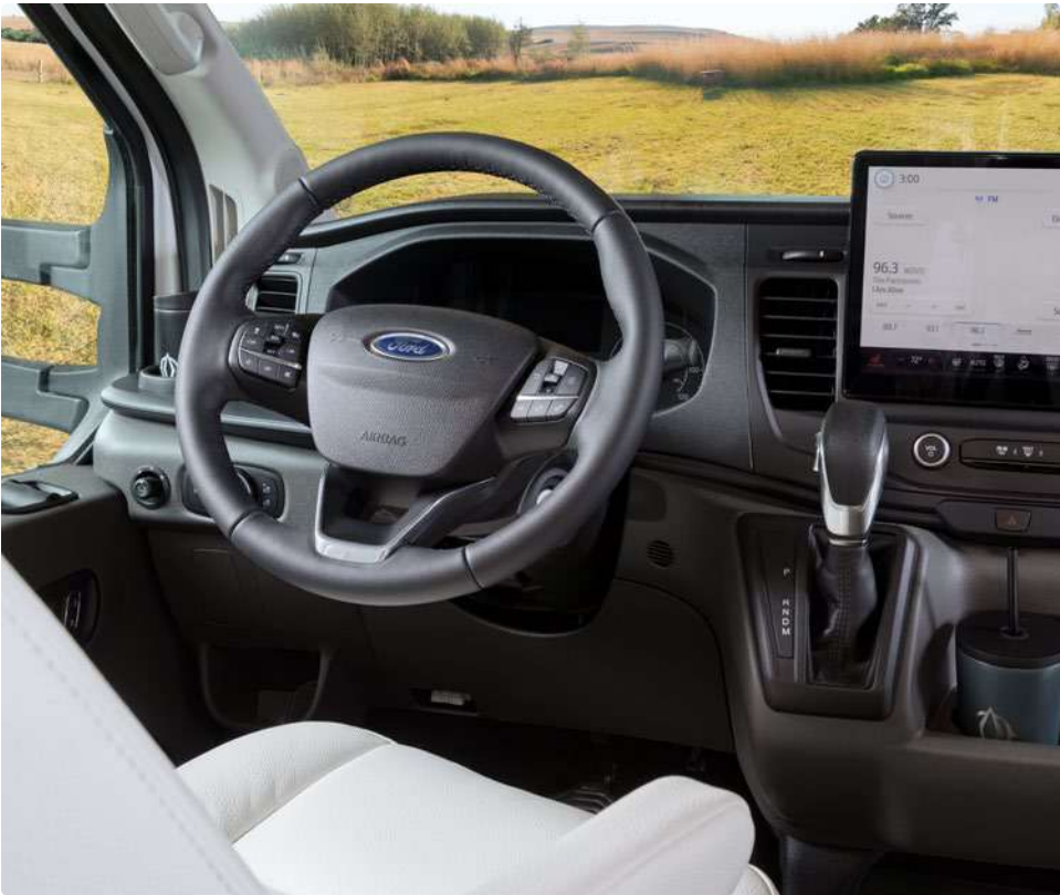
Ford Transit Chassis with Intelligent All-Wheel Drive