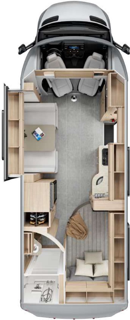
Corner Bed | U24CB (Shown with Standard Dinette)