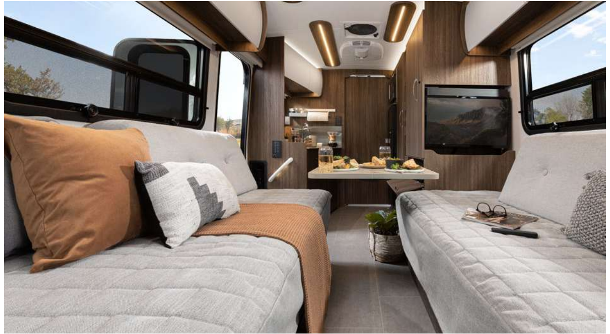
Mocha shown with Cabinetry Upgrade