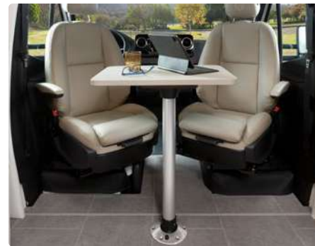
Removable Front Table between Captain Chairs (Murphy Bed, FX, Corner Bed)