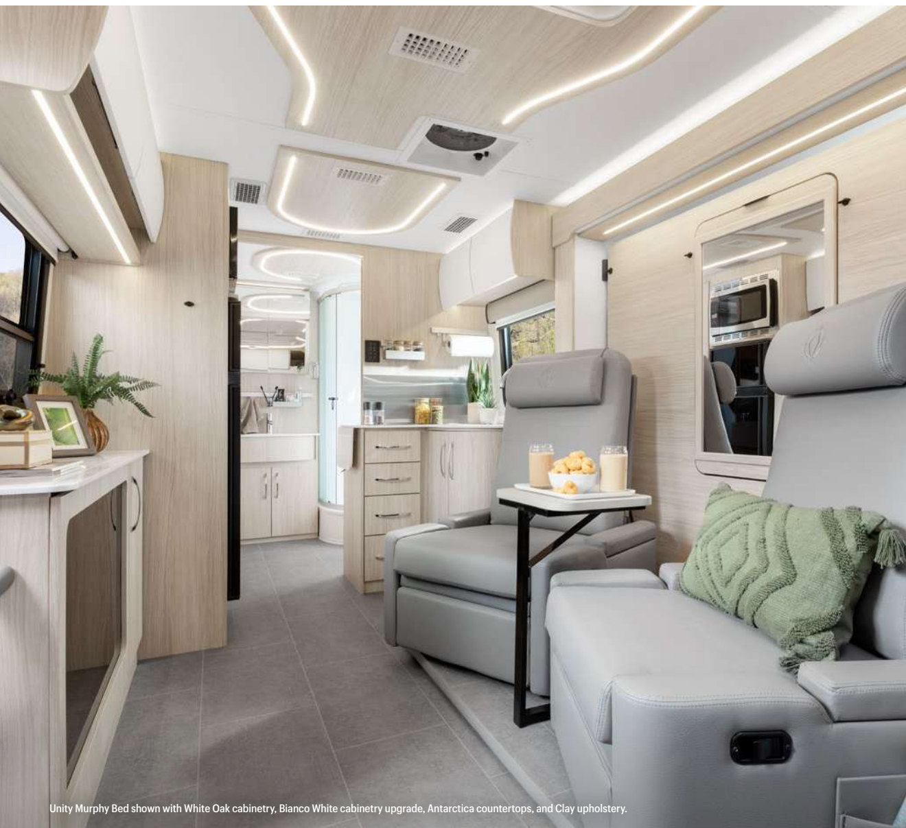
Unity Murphy Bed shown with White Oak cabinetry, Bianco White cabinetry upgrade, Antarctica countertops, and Clay upholstery.