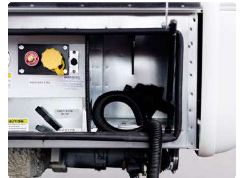
Macerator Sewage Discharge With Manual Disconnect