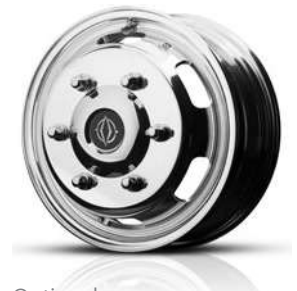
Optional Alcoa Dura-Bright® Aluminum Wheels All 6 Aluminum Wheels, 4 Dura-Bright® Wheels