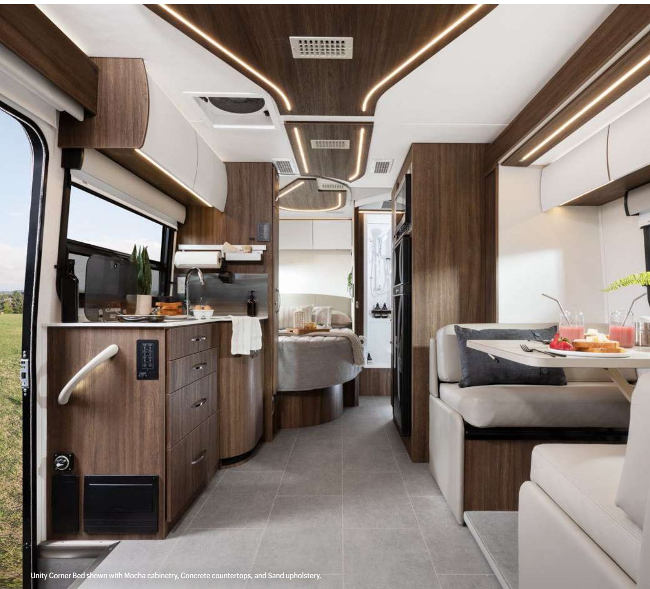
Unity Corner Bed shown with Mocha cabinetry, Concrete countertops, and Sand upholstery.