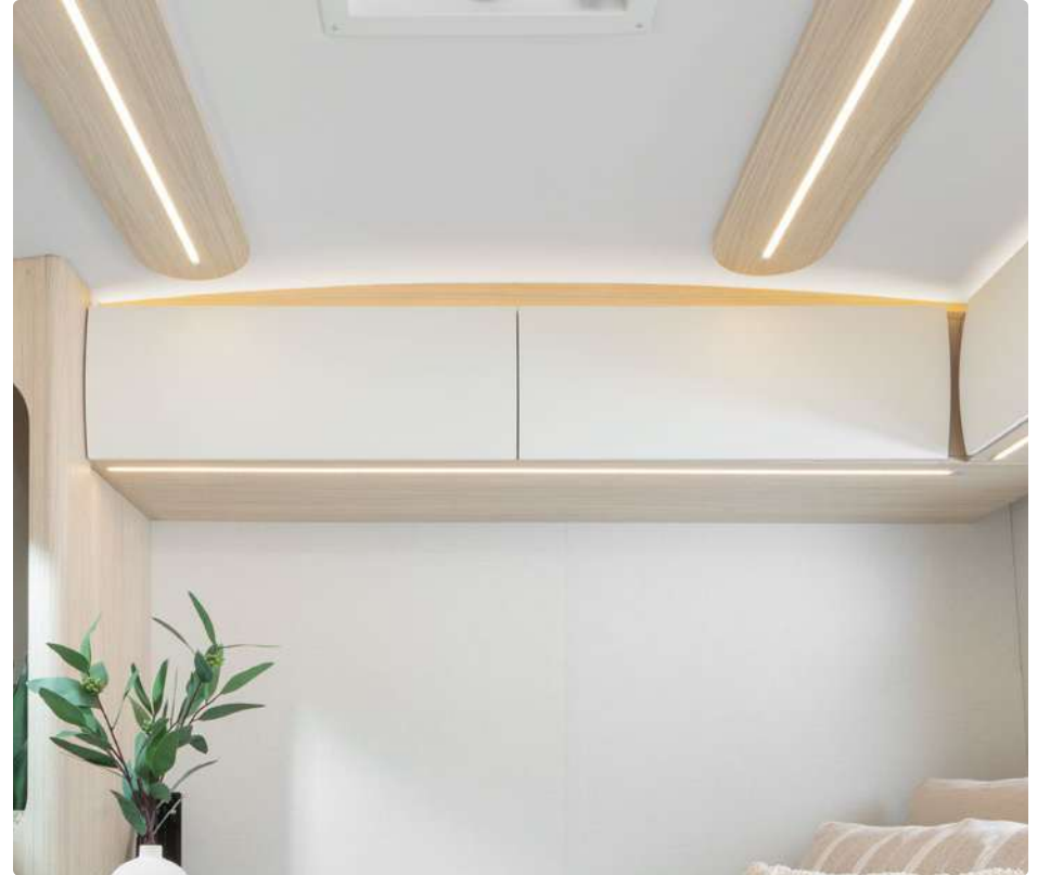
Cabinetry Upgrade FENIX NTM® Matte Overhead Cabinet Doors