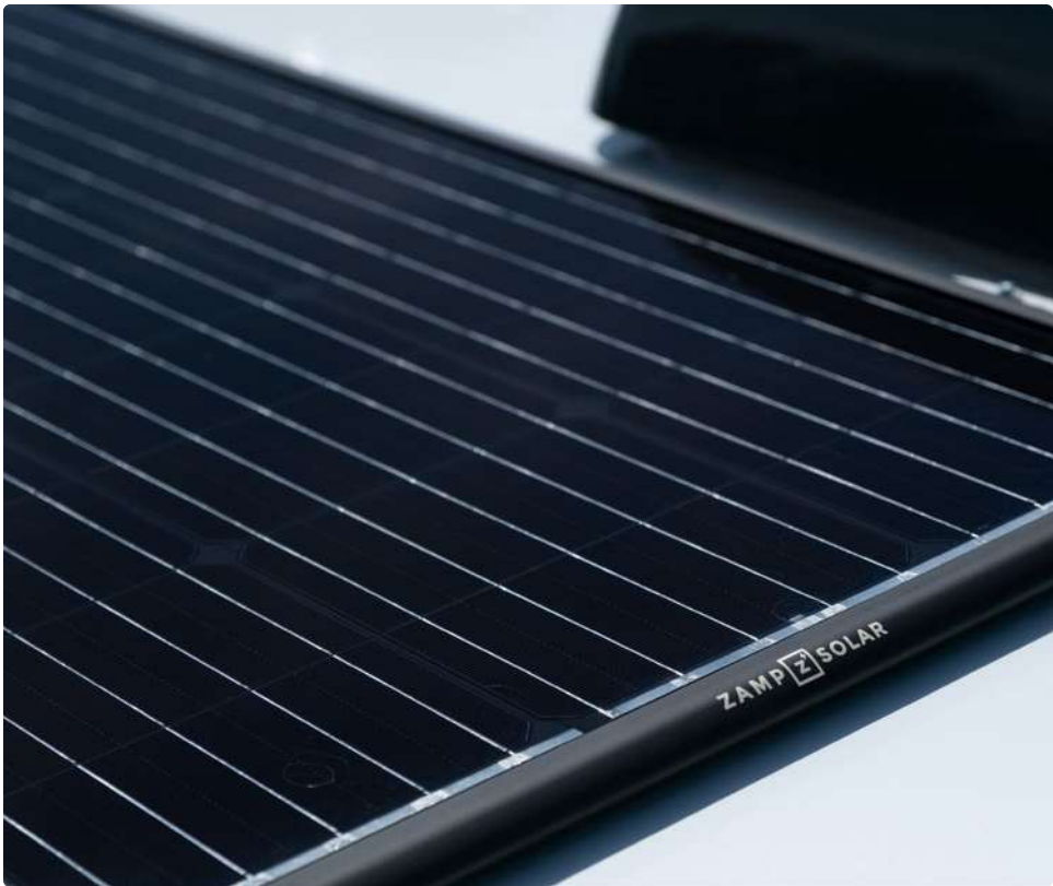
Rigid Solar Panels with Control Panel 200 W or 400 W