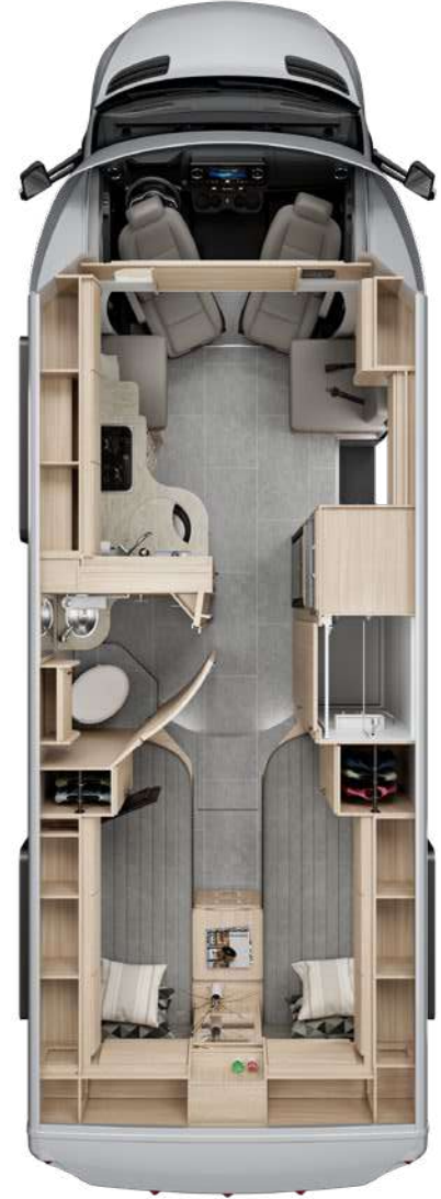
Twin Bed | U24TB