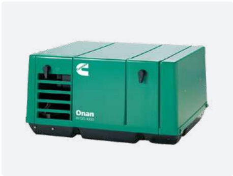
4.0 kW Gas Generator (Mandatory Option) With Auto Start and Auto Changeover Switch