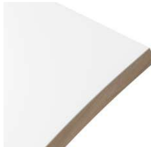
Bianco White FENIX NTM®