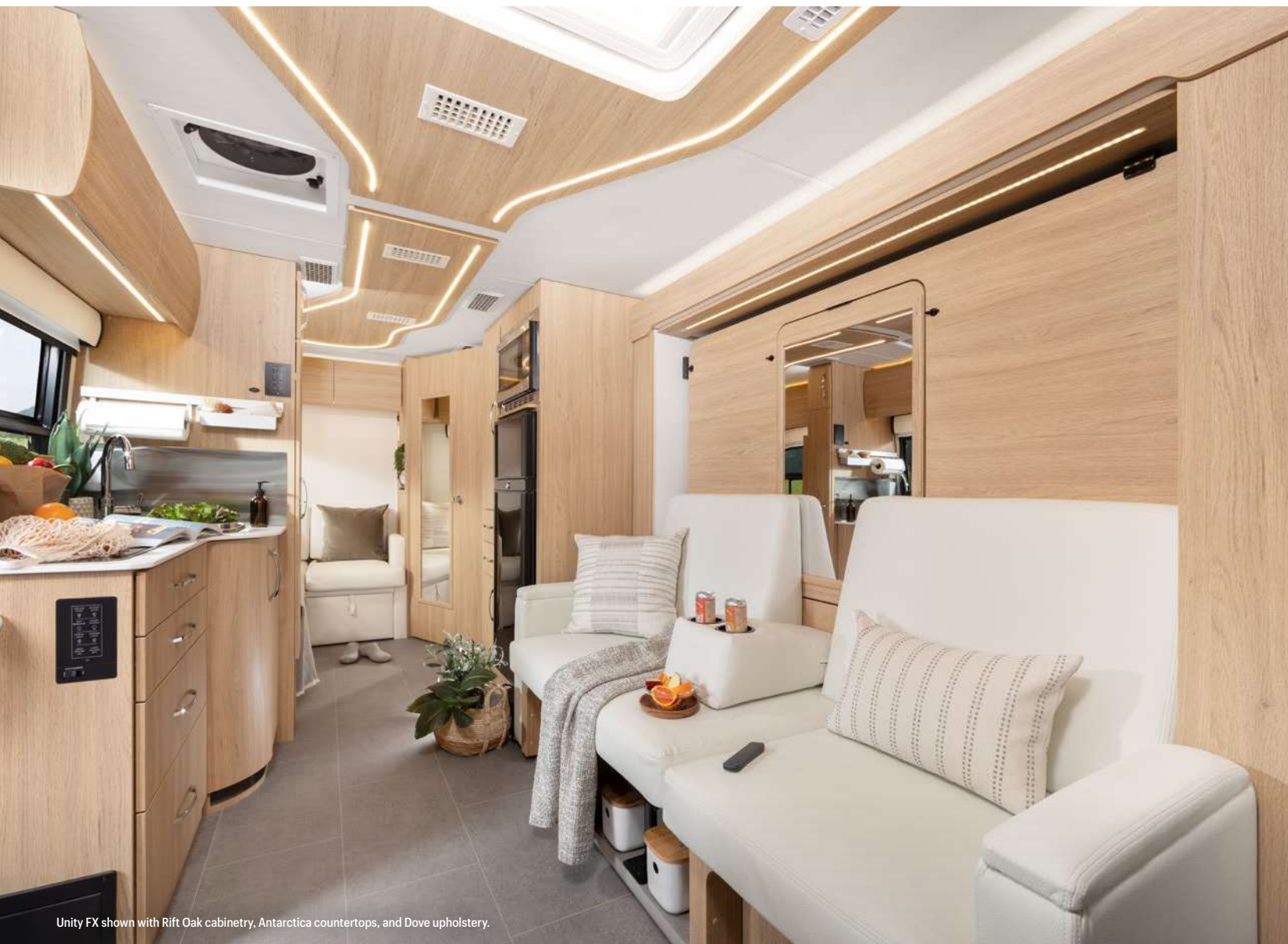
Unity FX shown with Rift Oak cabinetry, Antarctica countertops, and Dove upholstery.