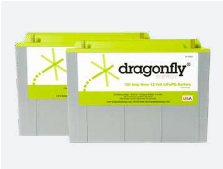
Dual 100 A-h, 12 V Lithium Coach Batteries With Built-in Heating Function