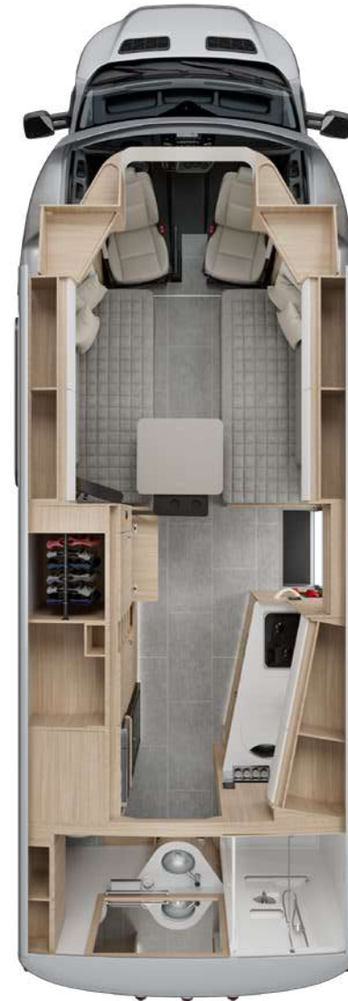
Front Twin Bed | W24FTB