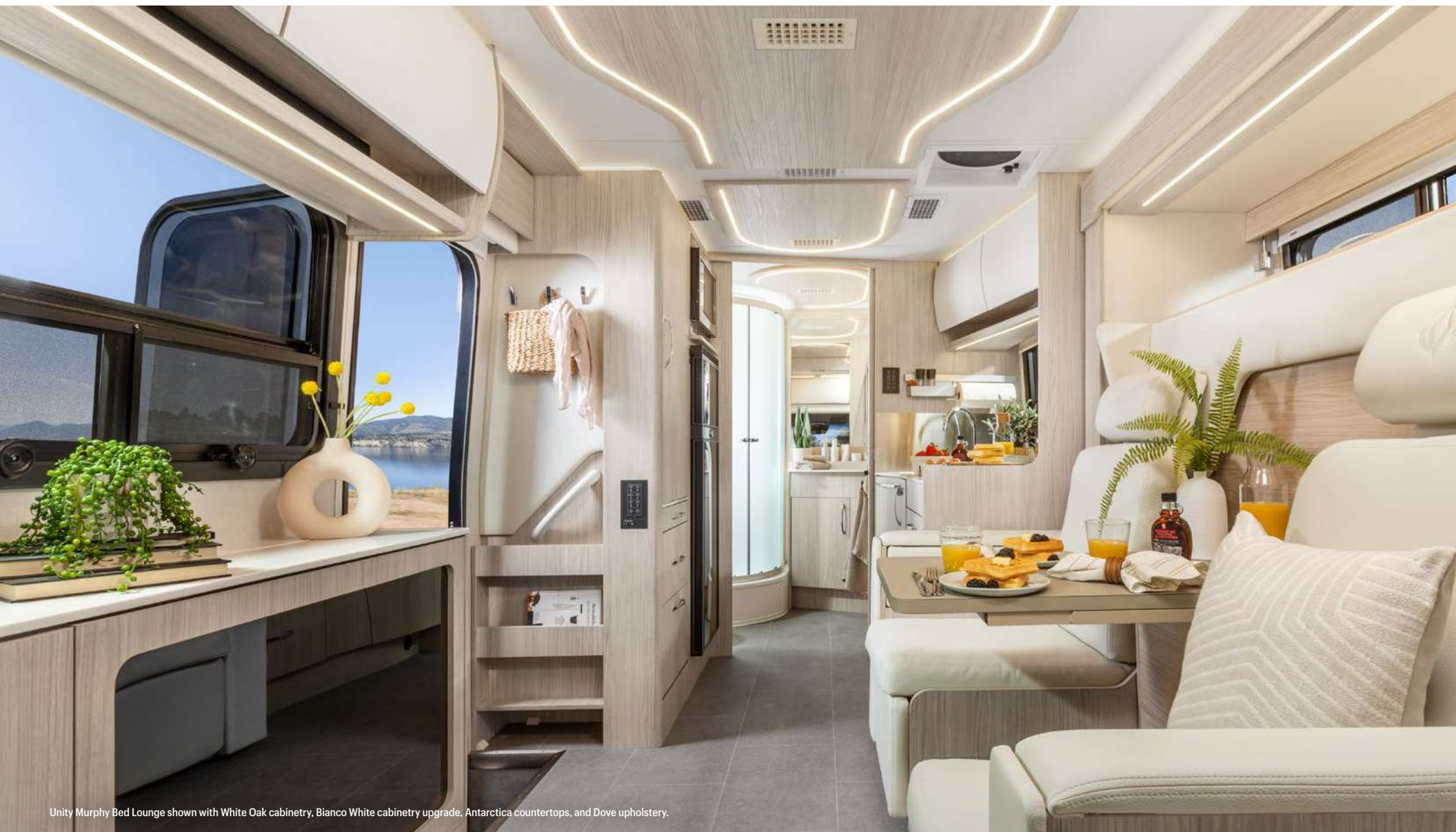
Unity Murphy Bed Lounge shown with White Oak cabinetry, Bianco White cabinetry upgrade, Antarctica countertops, and Dove upholstery.

Unity Murphy Bed Lounge | U24MBL PREVIEW