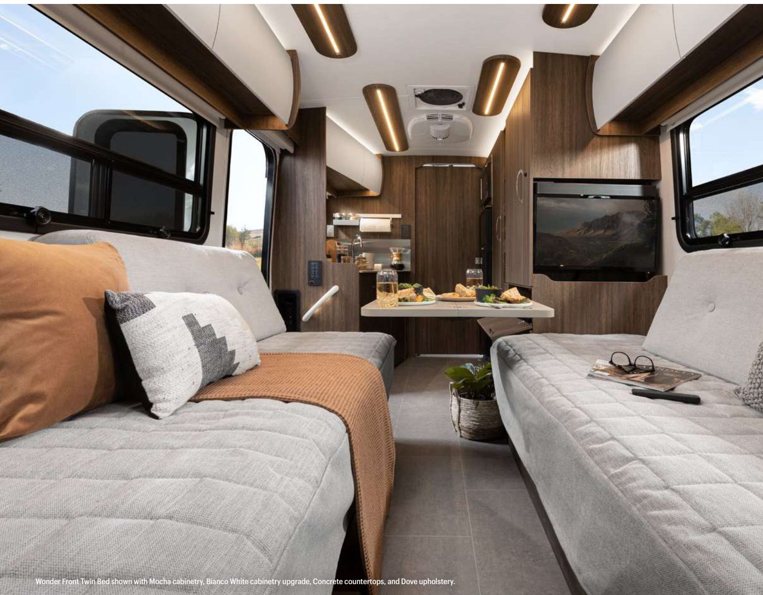
Wonder Front Twin Bed shown with Mocha cabinetry, Bianco White cabinetry upgrade, Concrete countertops, and Dove upholstery.