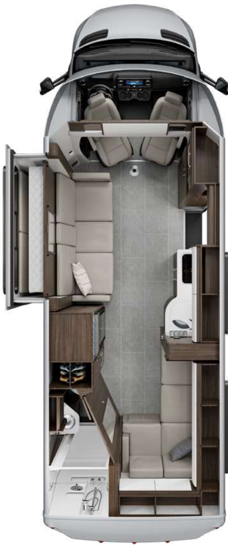
FX | U24FX