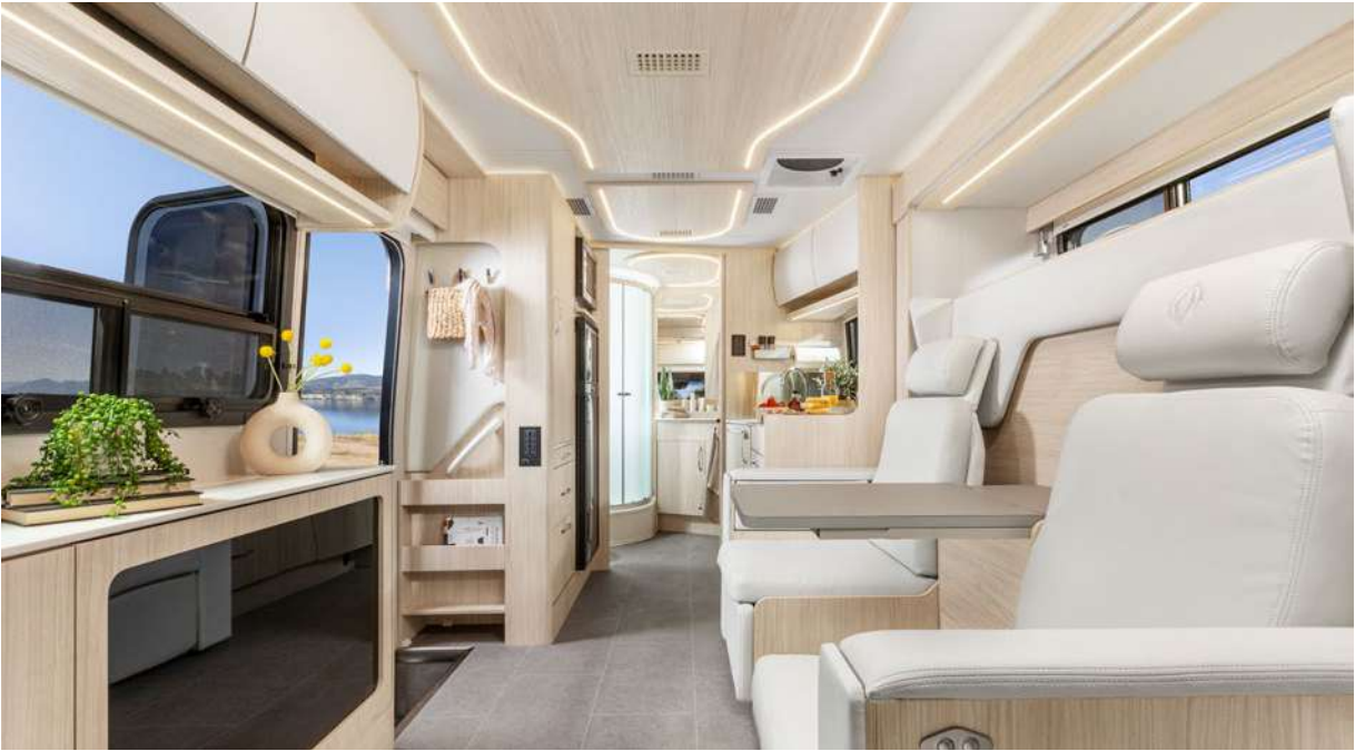
White Oak shown with Cabinetry Upgrade