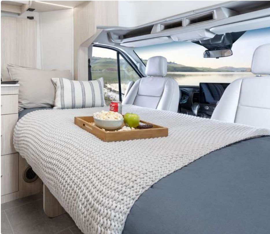
Inflatable Bed for Front Dinette 45" x 88" Sleeping Area (RL, RTB)