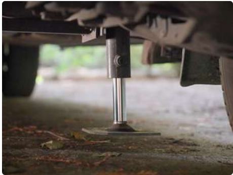
4-Point Self-Leveling Jacks