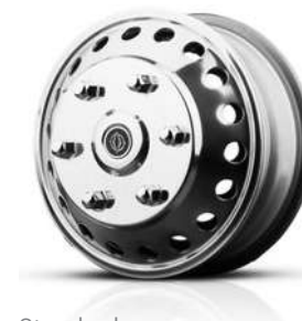
Standard Steel Wheels With Wheel Simulators