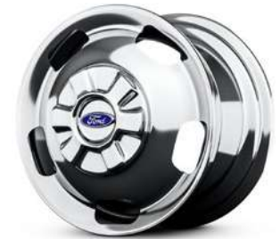
Aluminum Alloy Wheels Standard