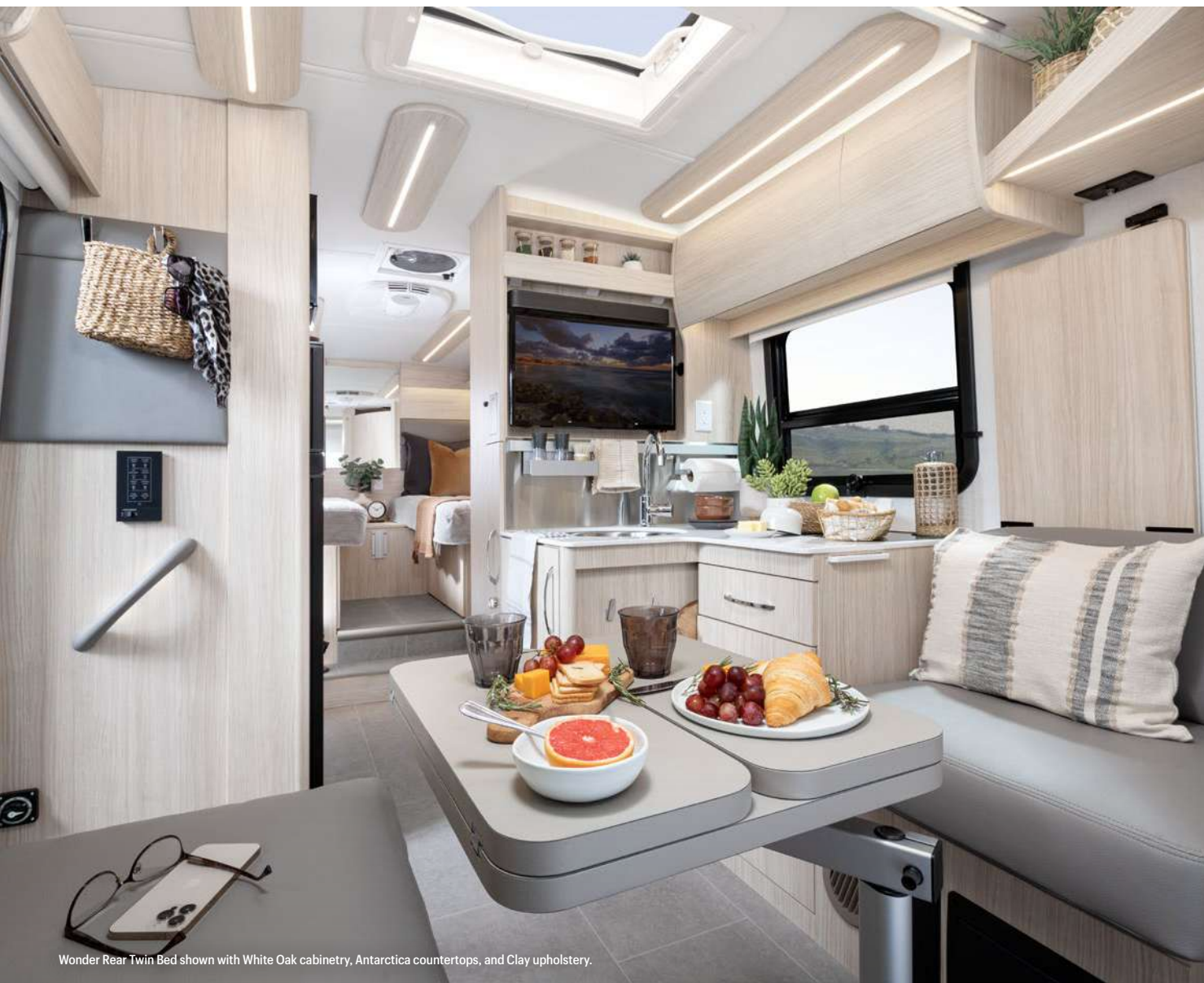
Wonder Rear Twin Bed shown with White Oak cabinetry, Antarctica countertops, and Clay upholstery.