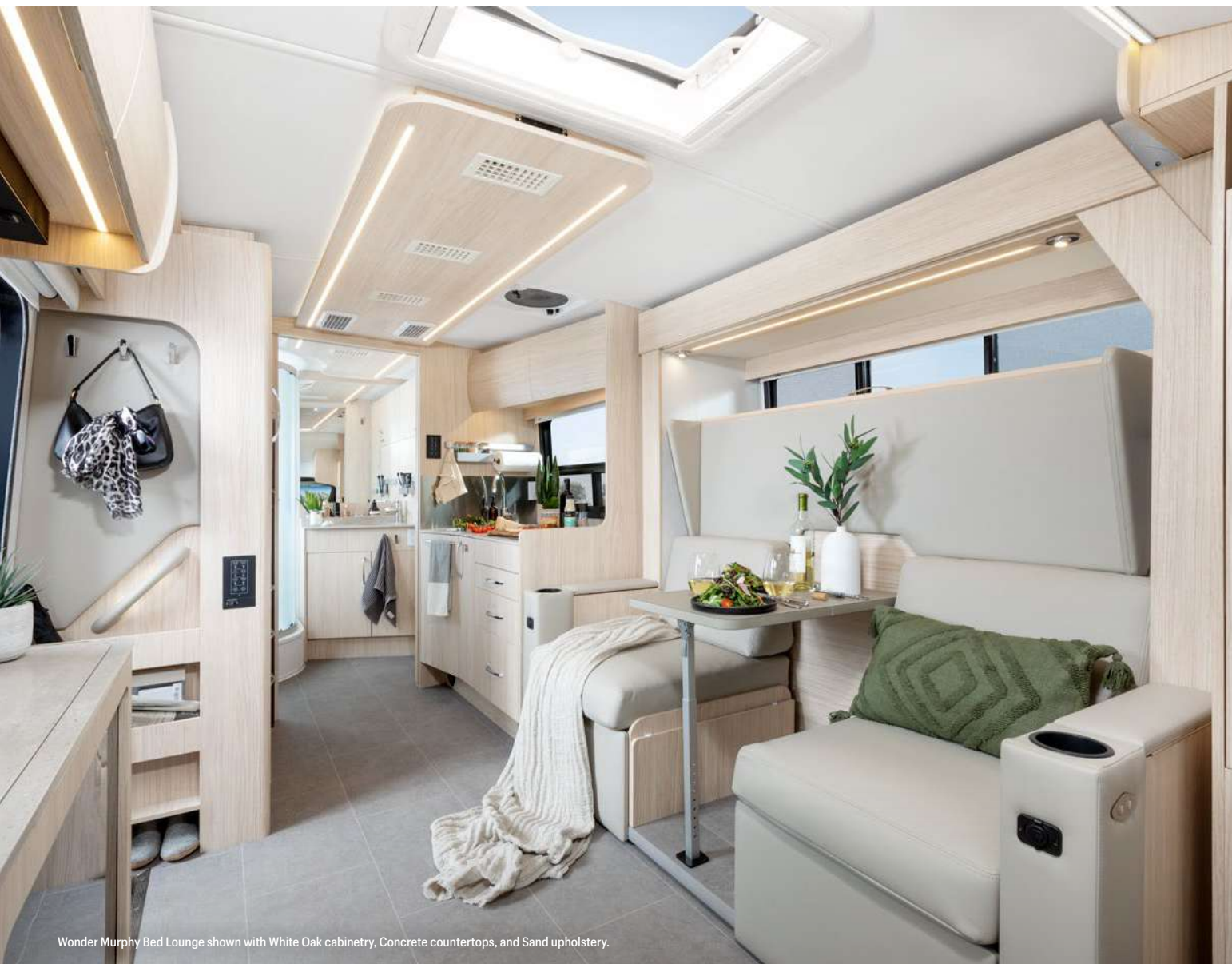
Wonder Murphy Bed Lounge shown with White Oak cabinetry, Concrete countertops, and Sand upholstery.