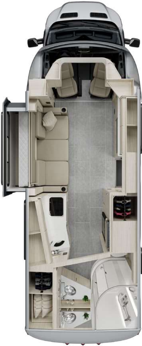
Murphy Bed Lounge | W24MBL