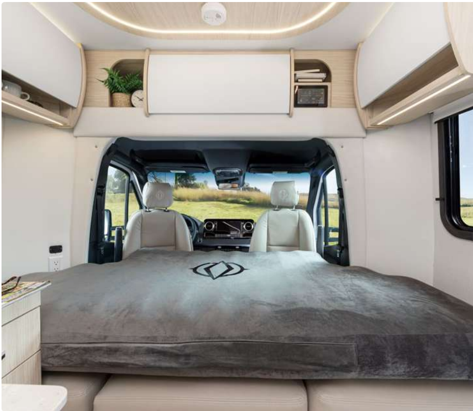
Inflatable Bed for Front Dinette 45" x 88" Sleeping Area (Rear Lounge, Twin Bed)