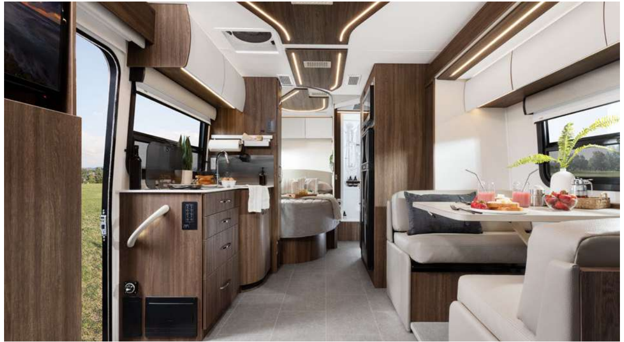
Mocha shown with Cabinetry Upgrade