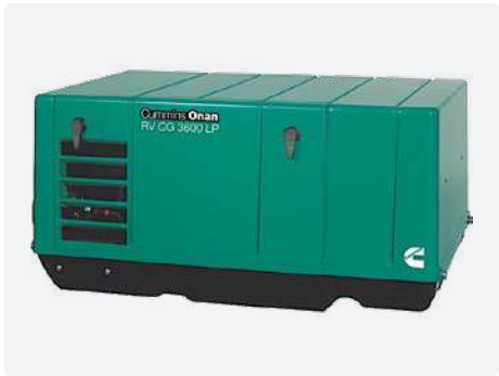
3.6 kW LP Generator With Auto Start and Auto Changeover Switch