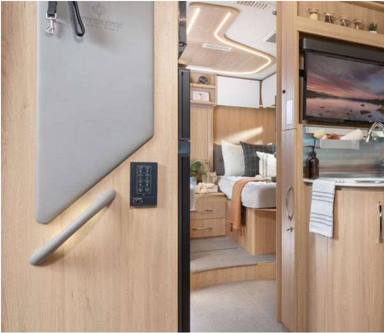
Rift Oak shown with Cabinetry Upgrade