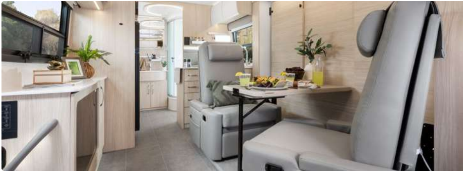
Leisure Lounge System Plus Dinette System 2 Ultraleather® Rotating Power Recliners (Murphy Bed)