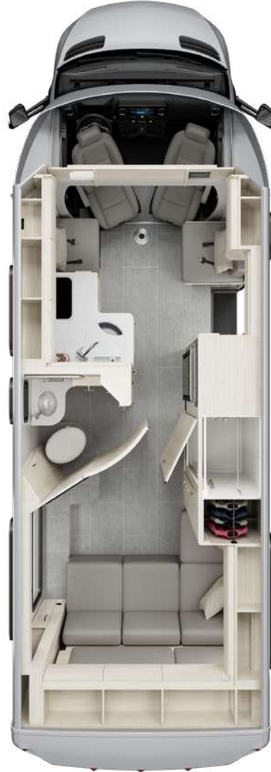
Rear Lounge | U24RL