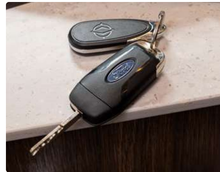
Keyless Entrance Door