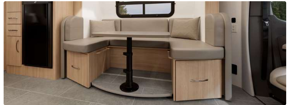
U-Lounge Dinette with Easy Lift Table Ultraleather® 40" x 69" Sleeping Area (Corner Bed)