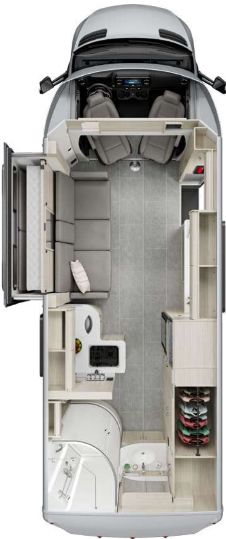
Murphy Bed | U24MB (Shown with standard Leisure Lounge)