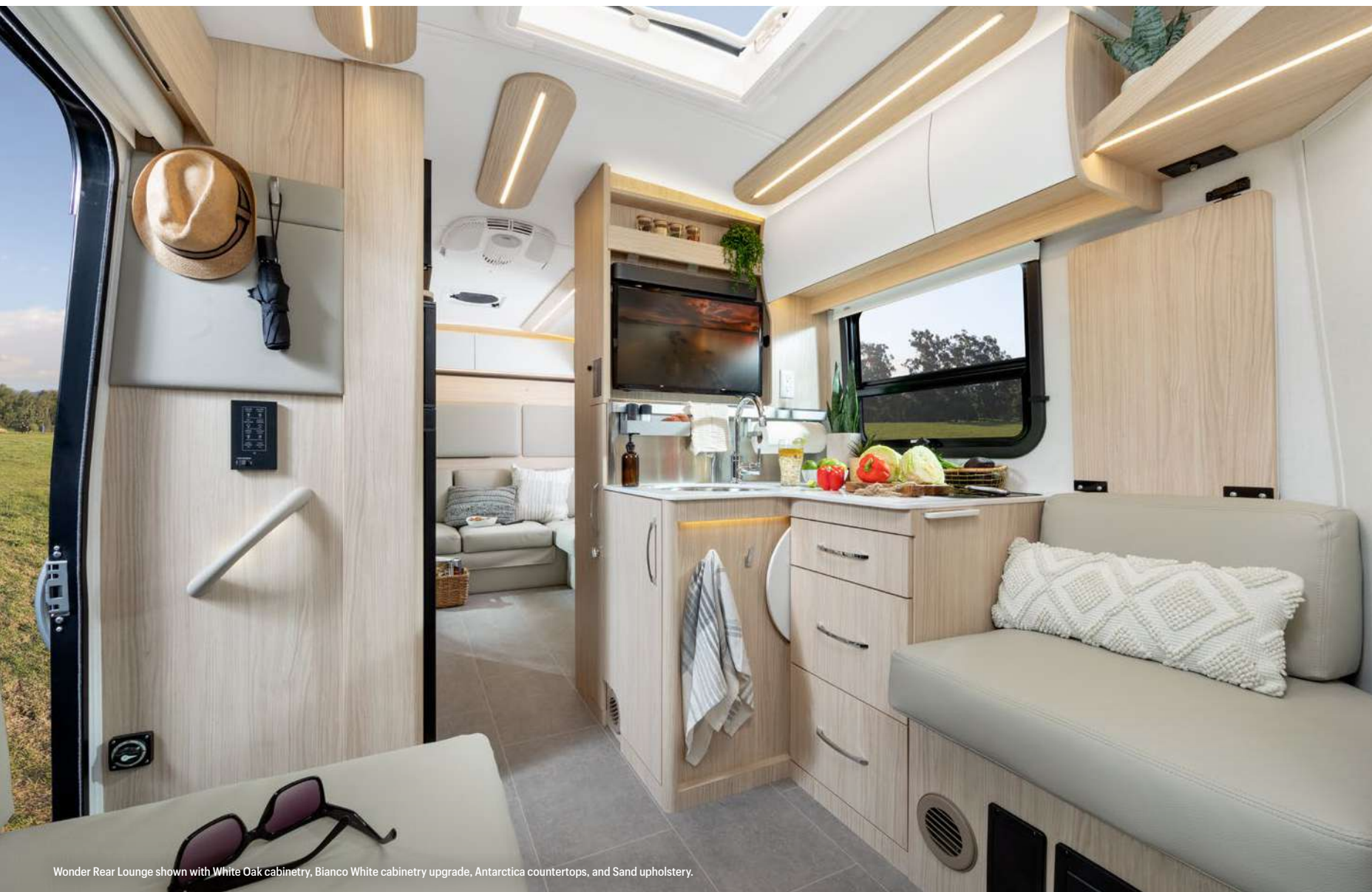
Wonder Rear Lounge shown with White Oak cabinetry, Bianco White cabinetry upgrade, Antarctica countertops, and Sand upholstery.