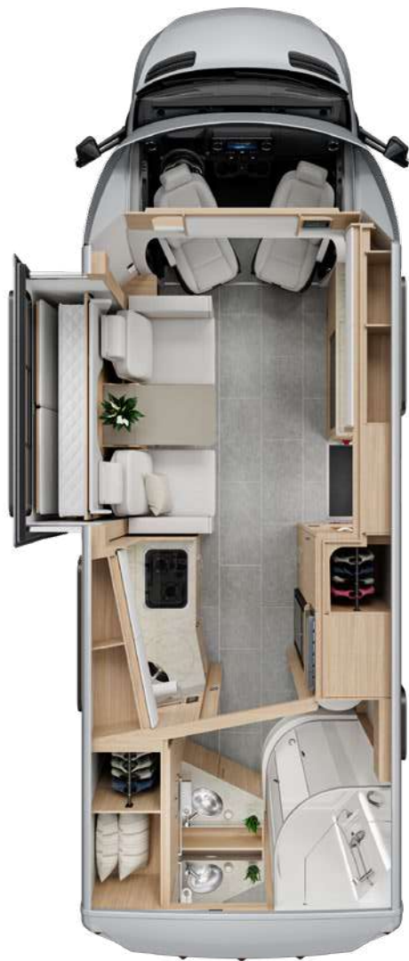
Murphy Bed Lounge | U24MBL