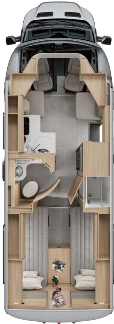
Rear Twin Bed | W24RTB