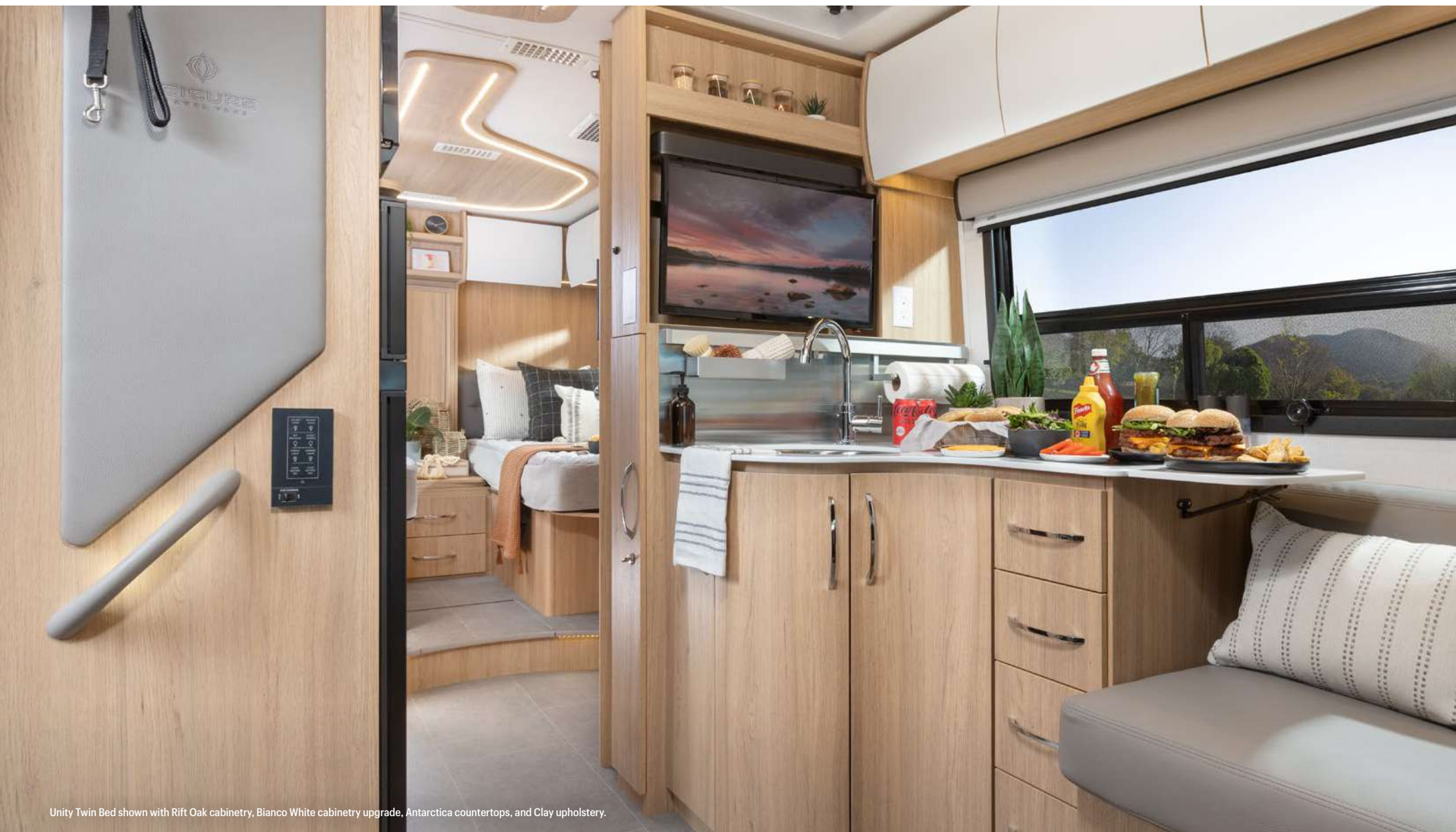
Unity Twin Bed shown with Rift Oak cabinetry, Bianco White cabinetry upgrade, Antarctica countertops, and Clay upholstery.