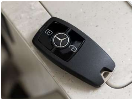
Remote Key Fob Entry Coach Entrance Door