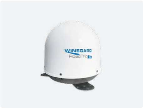
Auto-Acquisition Satellite Dish