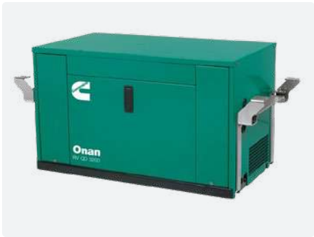
3.2 kW Diesel Generator With Auto Start and Auto Changeover Switch